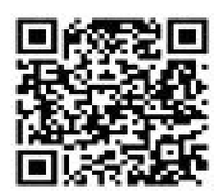
QR Code for SMSP