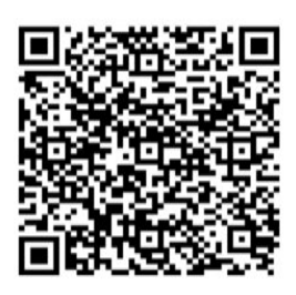
QR Code for OLOH